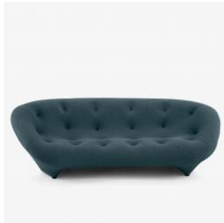
LARGE SETTEE HIGH BACK